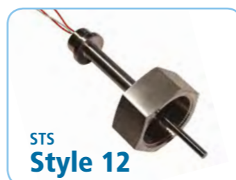
(items shown not necessarily to scale)